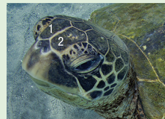
2 pre-frontal scales (between eyes)