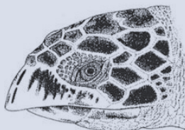
Narrow head and pointed beak