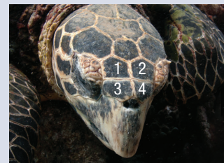
4 pre-frontal scales (between eyes)

Please Note: Hawksbills eat sponges which can make their meat toxic and lethal to humans.